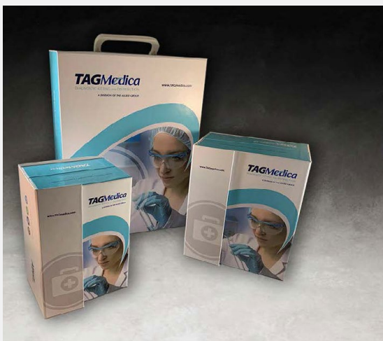
Example of medical kits produced by The Allied Group